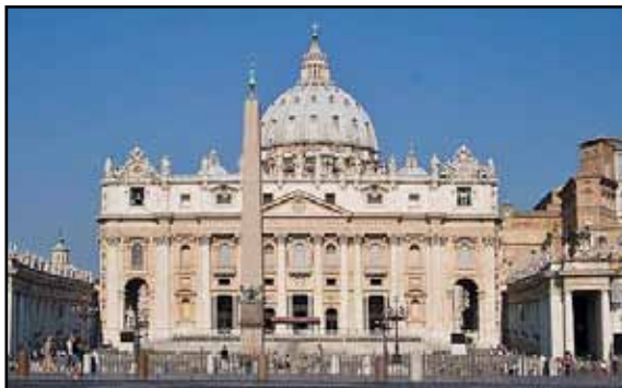
St Peter's Basilica, Rome

Visit major religious site in Rome and Constantinople (Istanbul), including: