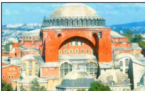
Hagia Sophia, Constantinople