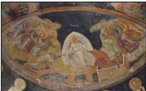
Christ the Savior in Chora, Constantinople

Learn what they accomplished for ecumenical dialogue and the Church.