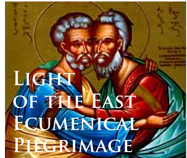
Icon of St. Peter & St. Andrew

OCTOBER 21-30, 2014 ROME AND CONSTANTINOPLE