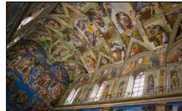
The Sistine Chapel, Rome

Explore historical sites of the Roman and Byzantine empires, including: